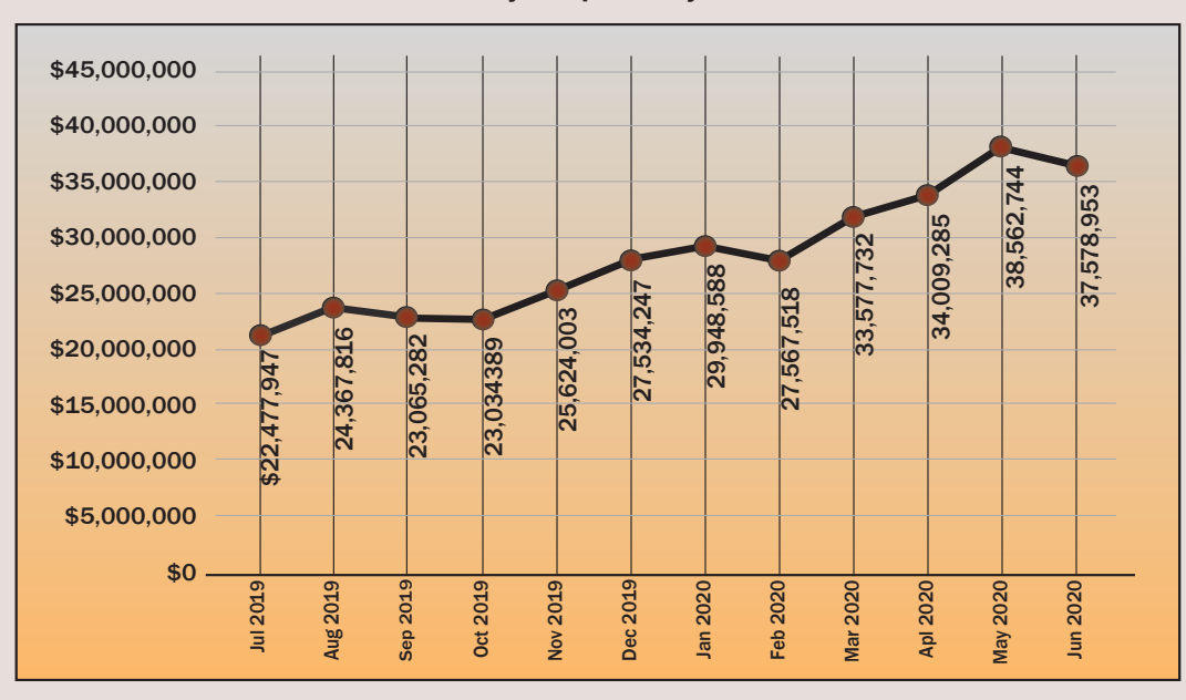
Year-to-Year Sales - Medical Only